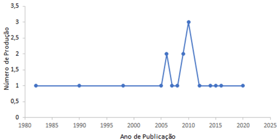
Figure 1. Annual evolution of Scientific Production in Brazil with the theme "indigenous knowledge about stingless bees", in the analyzed databases

Bahia (COSTA-NETO, 1990). Only after seven years (in 2005), a sequence of publications begins, slightly more constant, despite the temporal gaps presented by the years 2011, 2013, 2017, 2018 and 2019 (Table 1), with significant reductions, with 2006, 2009 and 2010 being the years of greatest scientific production, as shown in Figure 1.